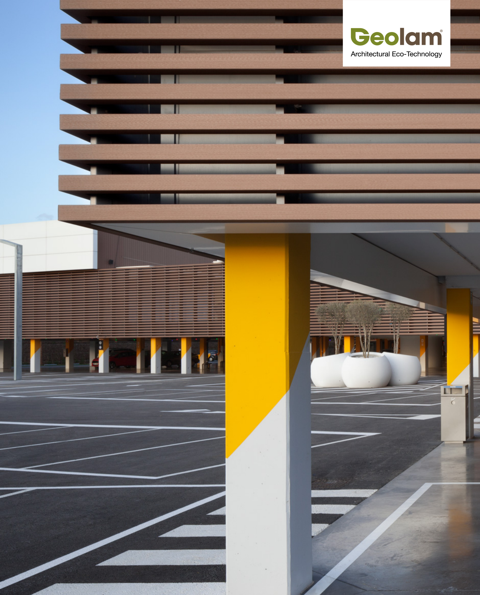
Viladecans The Style Outlets Louver, siding facade trim