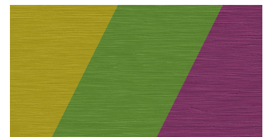
Any color on request